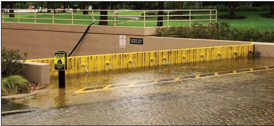
Figure 6: Automatic gate (deploys automatically when triggered by rising floodwater)