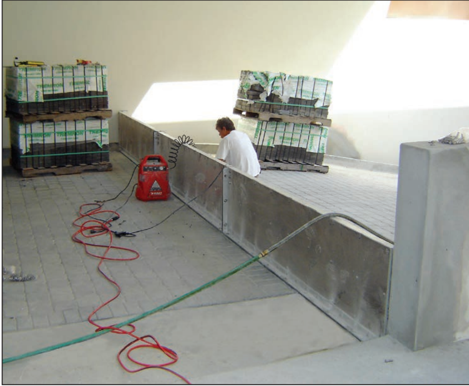
Figure 5: Manually deployed panel